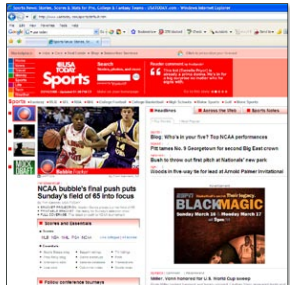
Figure 3: Online Advertising with Mobile Component