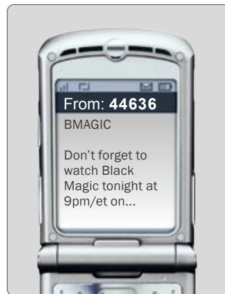
Figure 2: Viewer Reminder Message